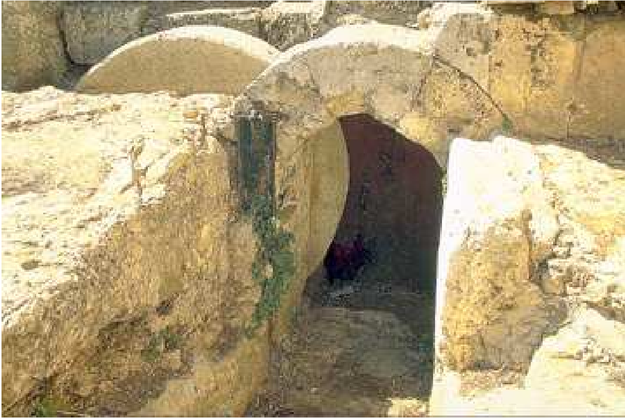
A rock-cut tomb, with a rolling stone door.