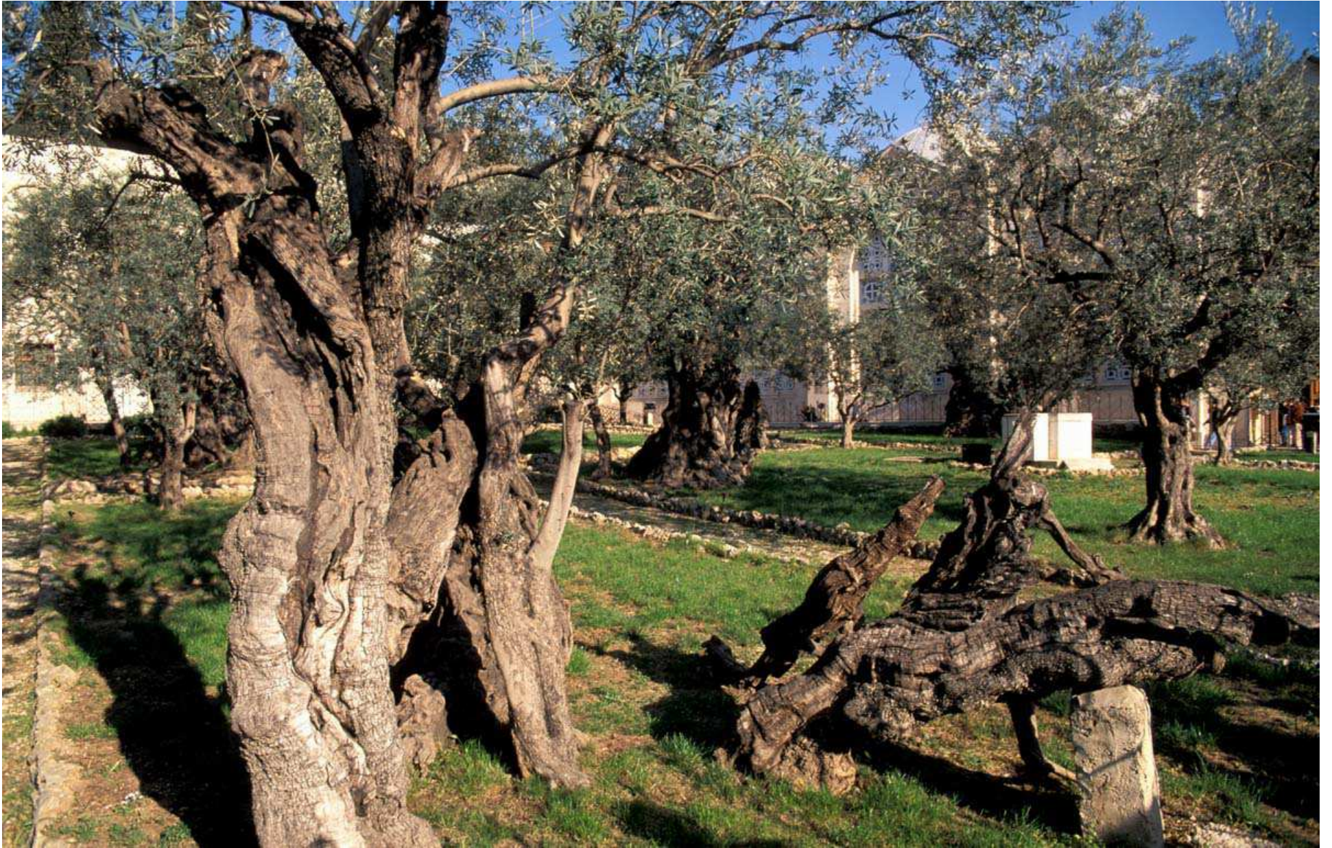
Garden of Gethsemane on the Mount of Olives.