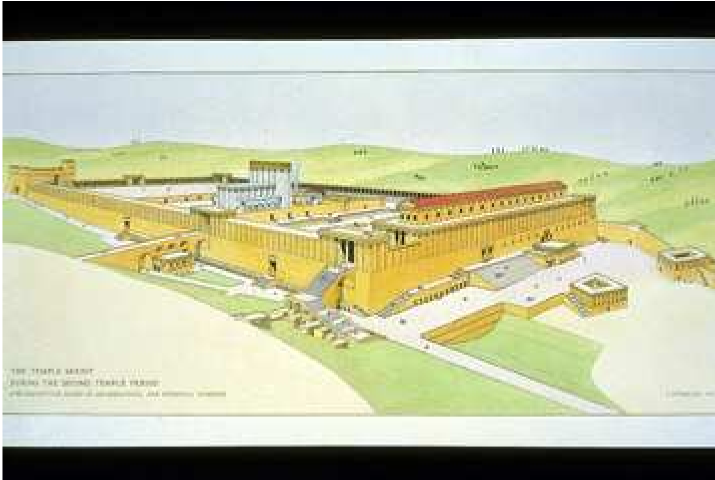
A drawing of the Temple Mount in Jerusalem as it would have appeared in Jesus' day. In the left center of the picture is the Western Wall, lying between Wilson's Arch at its north end and Robinson's Arch (with the stairway, at the corner of the wall) at its south end. To the right, on the south wall, is the Huldah Gate with its stairs, which remain today.