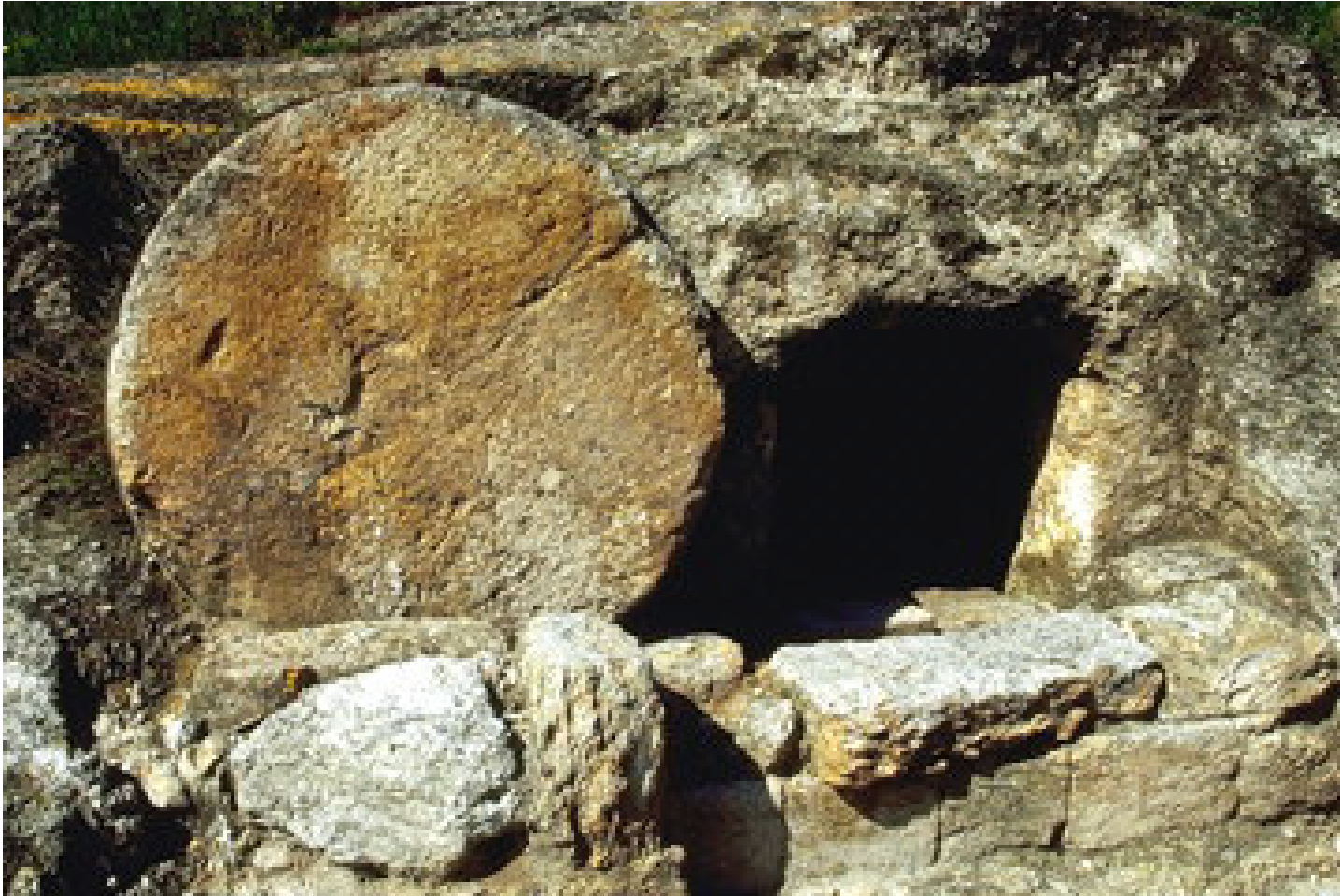
A rock-cut tomb, with a rolling stone door.