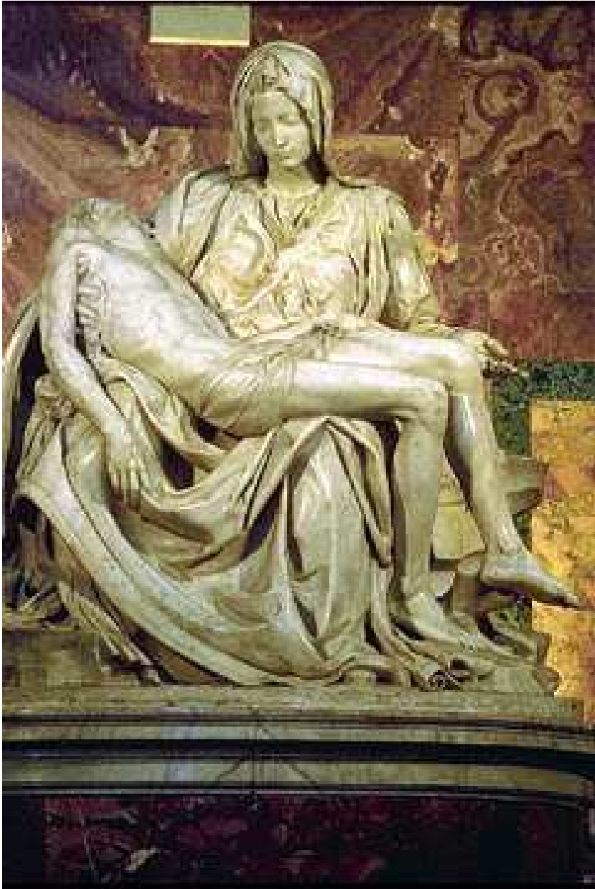
Michelangelo's Pietà, showing Mary mourning over Jesus,