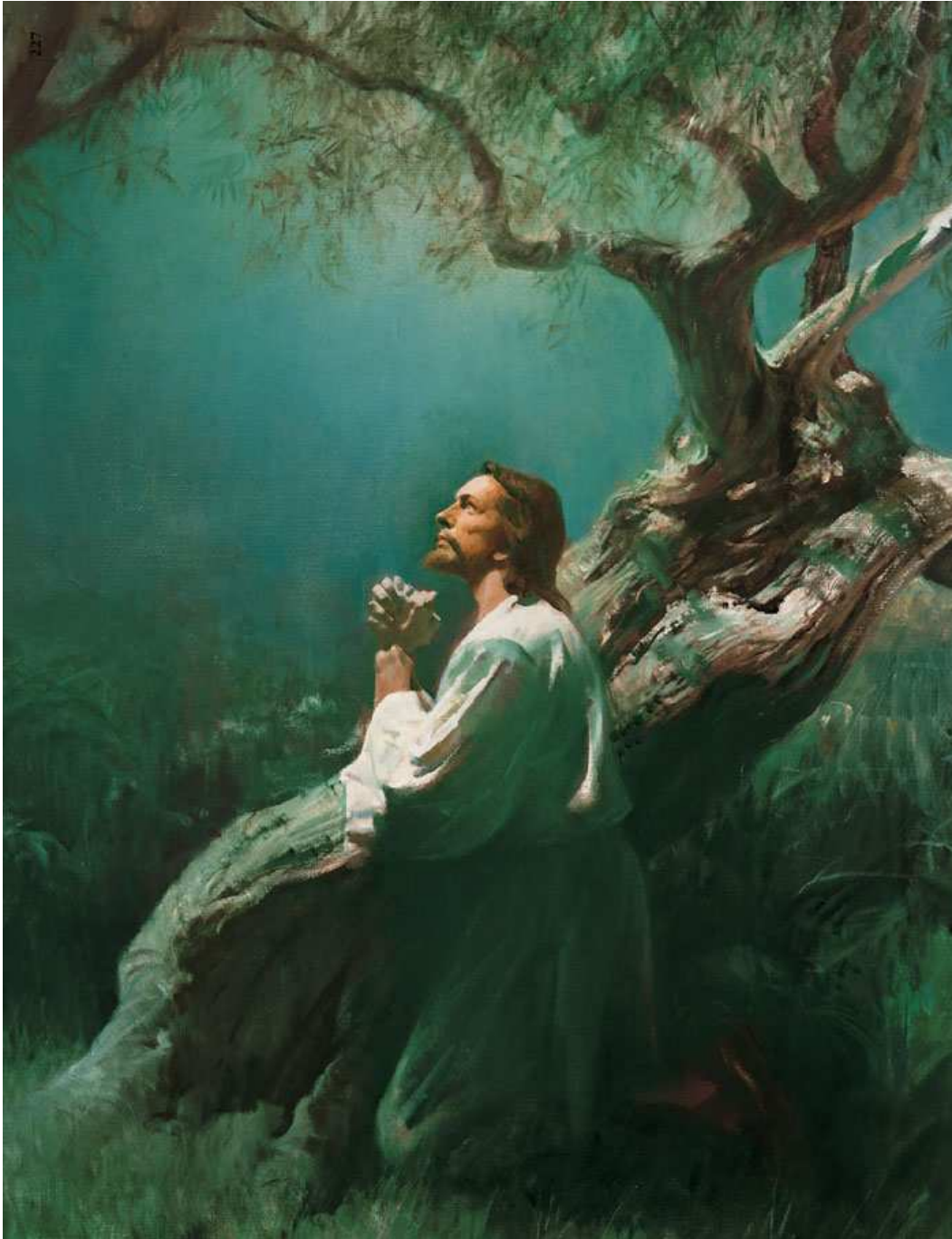
Jesus praying in Gethsemane