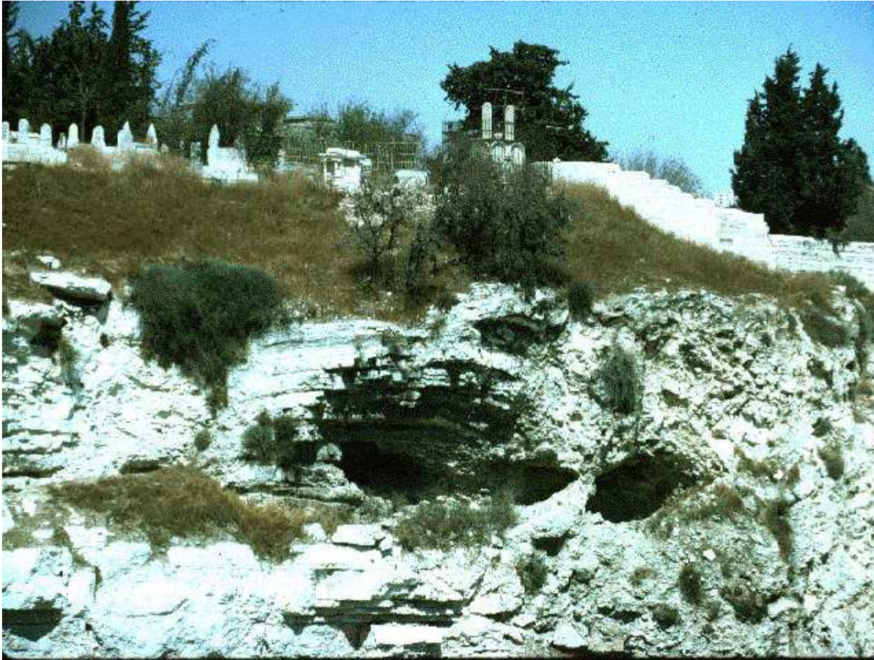
Gordon's Calvary, one of two sites considered to be the possible location of Jesus' crucifixion.