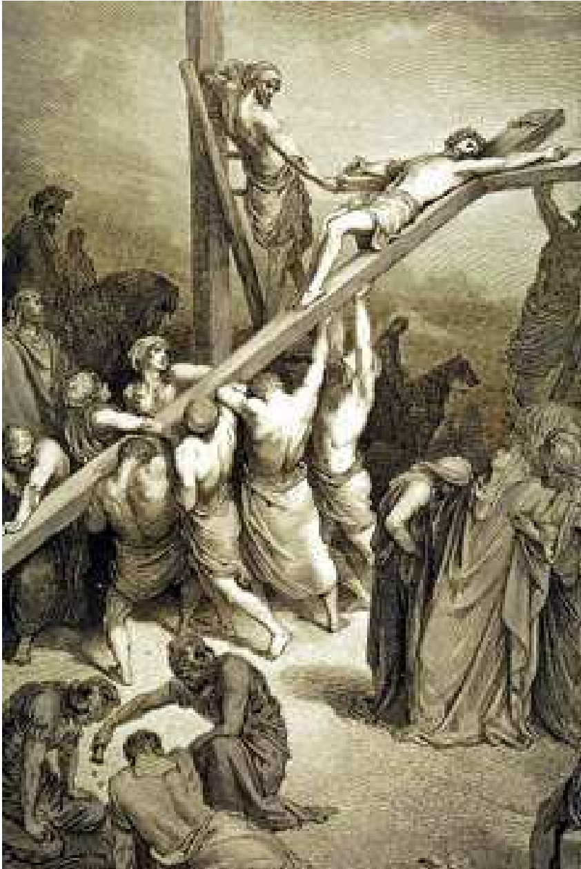
Jesus being raised on the cross