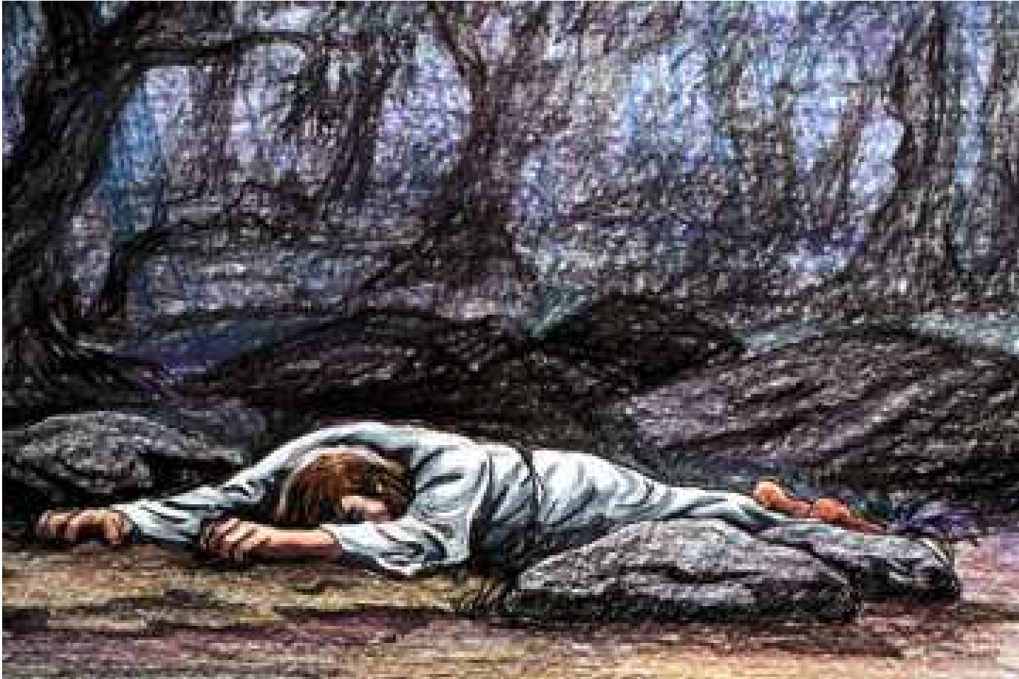
Jesus praying in Gethsemane