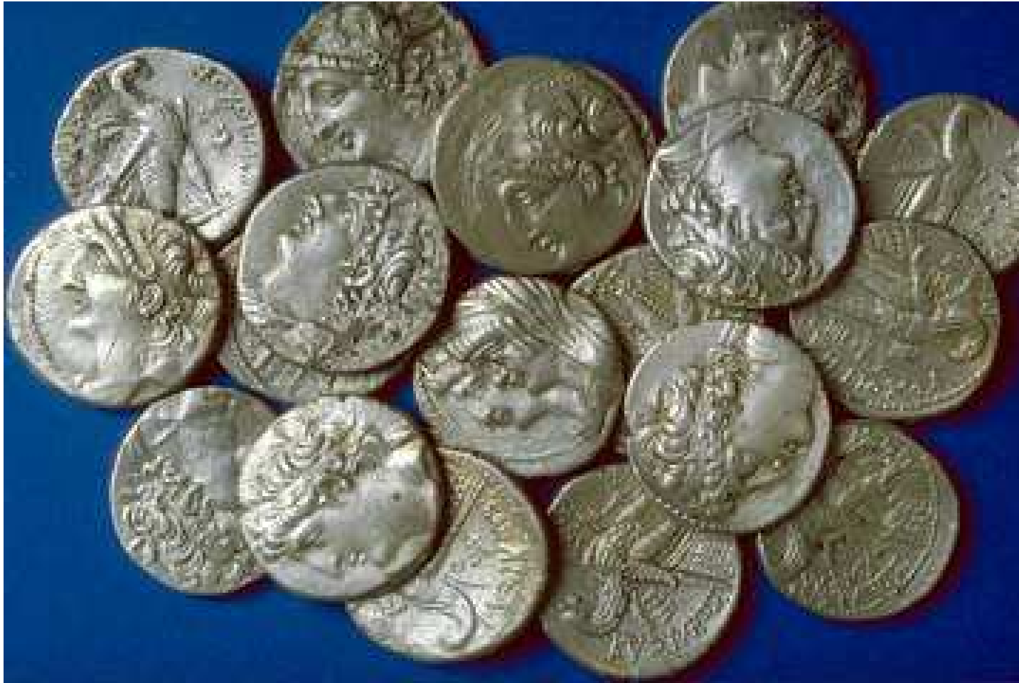
A hoard of Tyrian silver shekels which were used in the Temple Tax.