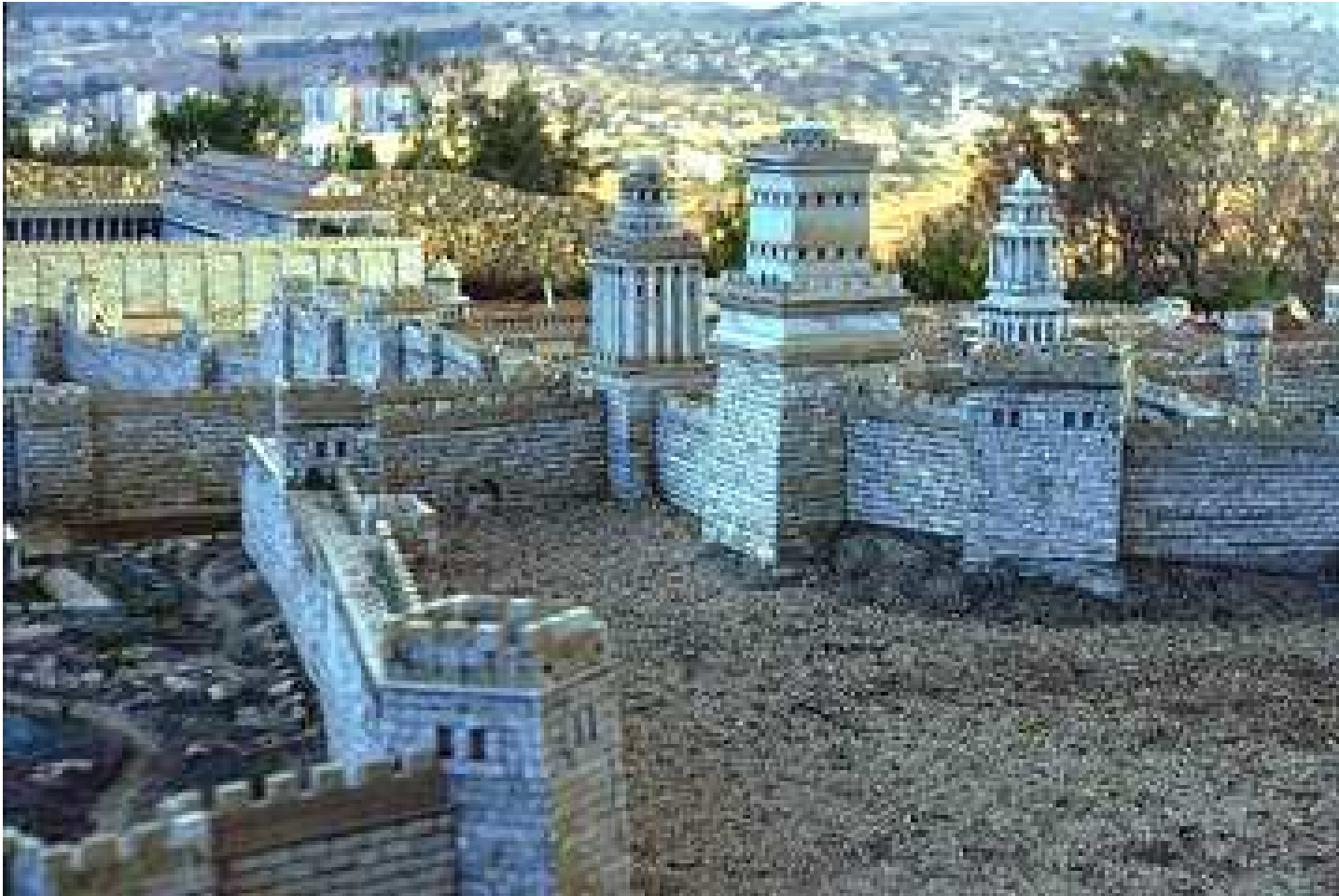
The model of first-century Jerusalem showing the three towers (Hippicus, Phasael, and Mariamne) built by Herod to protect his palace. The bottom portion of one (probably Phasael) still stands by Jaffa Gate today.