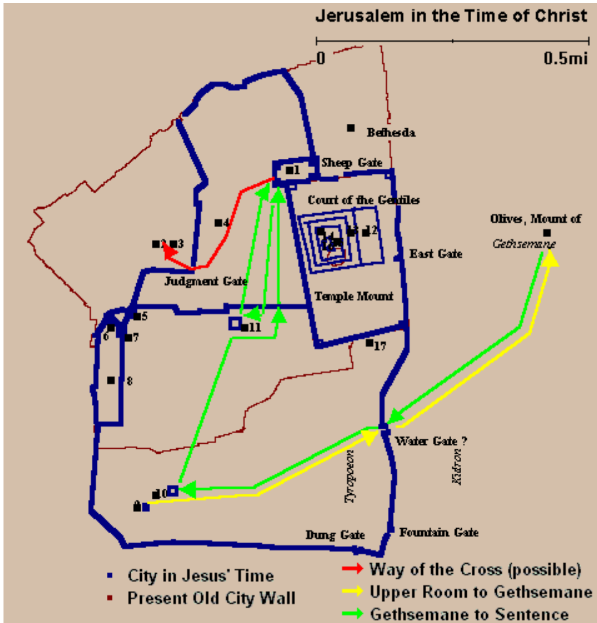
Last day for Jesus from the Upper Room to the cross.