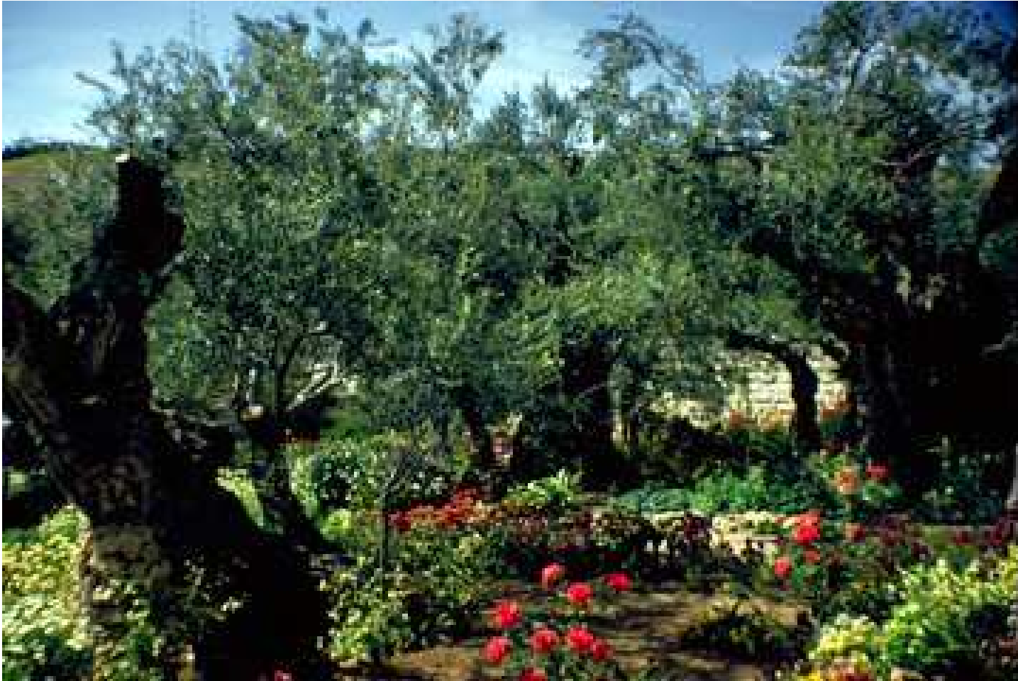
Olive trees in the Garden of Gethsemane on the Mount of Olives.