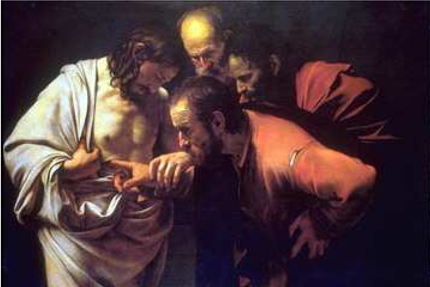
Caravaggio's painting of Thomas inspecting the wounds of Christ.